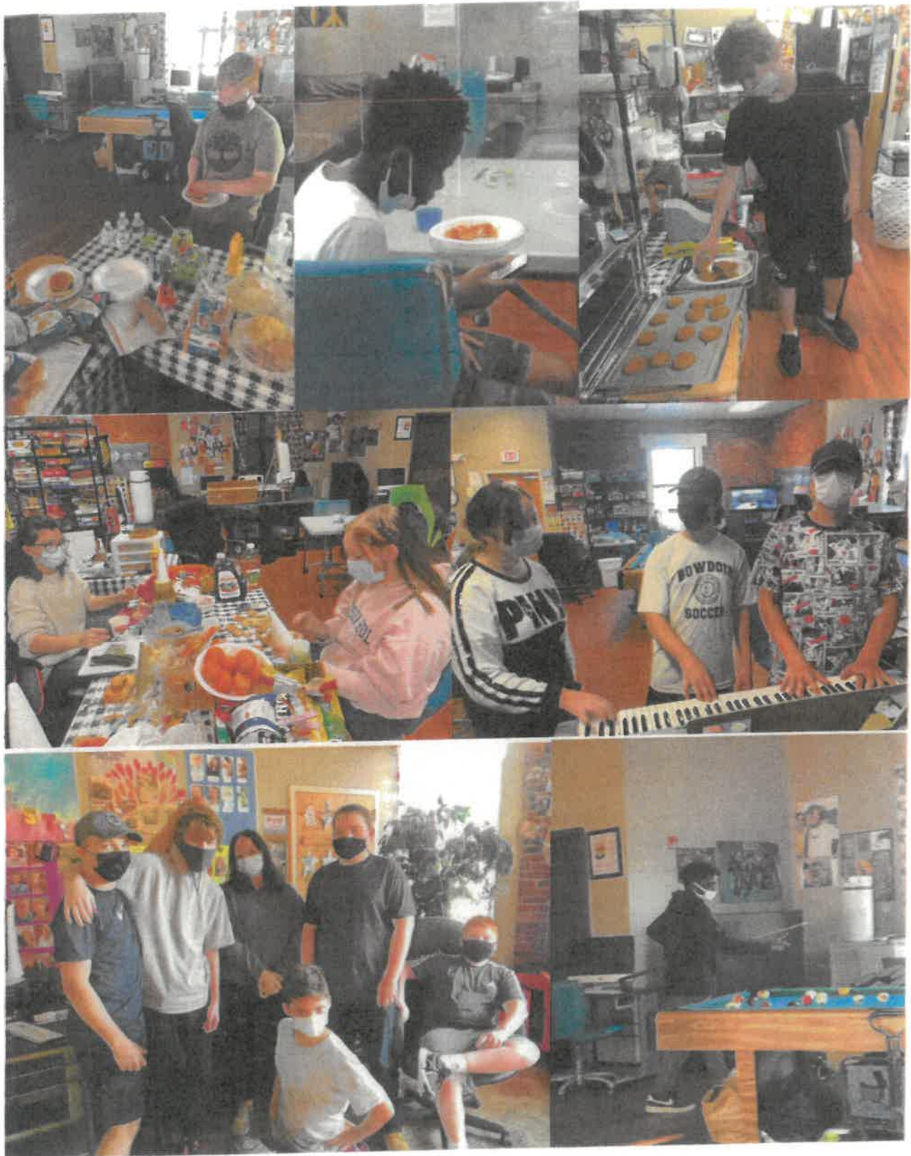
Brunswick Area Teen Center Program – Fall 2021