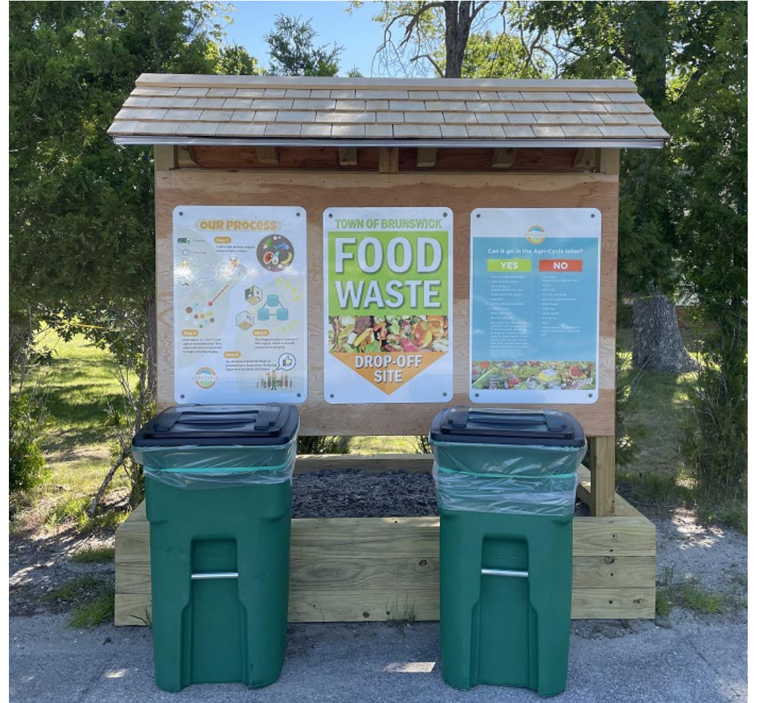
Organics Drop Off Center - Brunswick Landing, Rec Dept